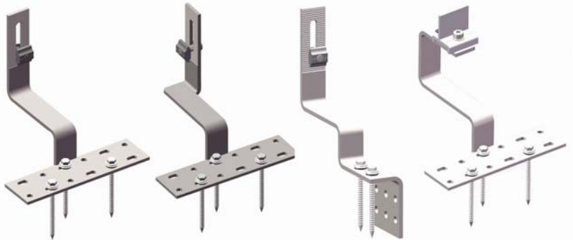
GM-RH-01 hook 1